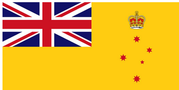
The Governor's Standard